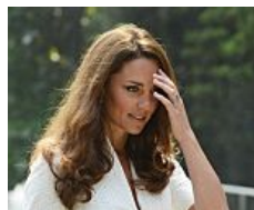
Stunning Pictures Of Kate Middleton