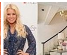
Stunning Photos Of Jessica Simpson's 8 Million Dollar Mansion LonnyMag