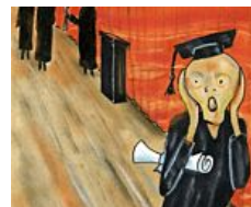
8 College Degrees That Aren't Worth the Money Salary.com